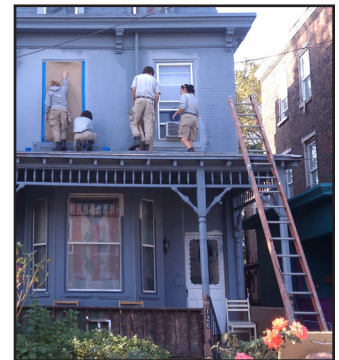
AmeriCorps volunteers hard at work on one of Respond's State Street properties.

The houses and their beautiful paint jobs were featured in the Courier Post , the Philadelphia Daily News , and the Philadelphia Inquirer . ▾