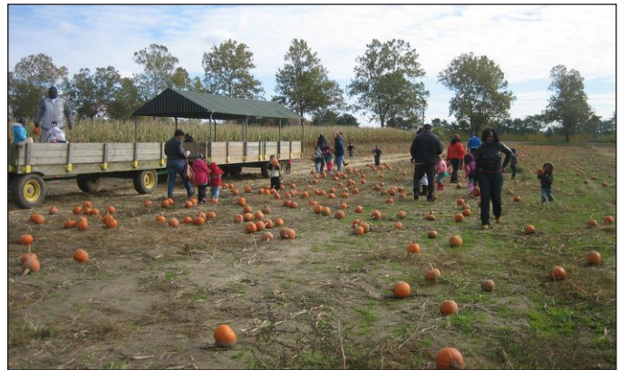
Students and teachers from the Fairview Village Center in the pumpkin fields at Duffield Farm in Sewell, N.J.

the Robert Wood Johnson Foundation to take part in an initiative to prevent childhood obesity by learning proper exercise and healthy eating techniques.