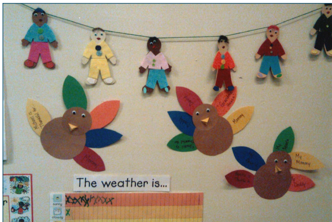
Fall-themed artwork covers the walls at the Bank Street Center.