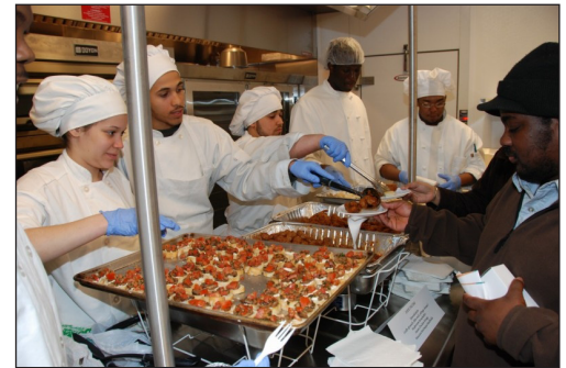
Culinary Arts students serve hors d'oeuvres in the New Worker Job Development Center kitchens.