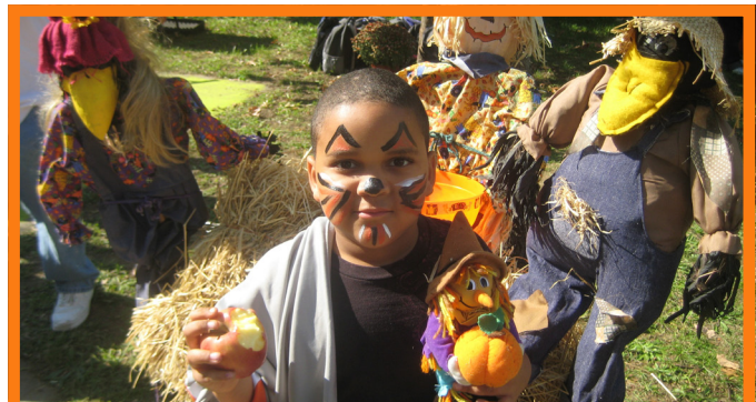
Neighborhood child at the Camden Fall Festival.