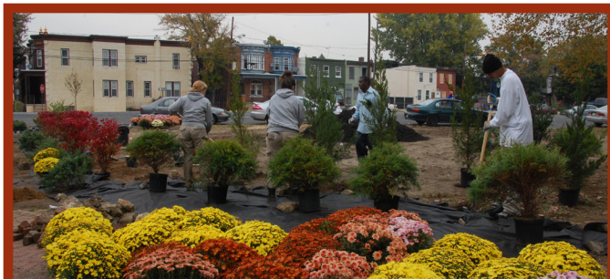
AmeriCorps volunteers team with workers from Respond, Inc. to beautify Triangle Park at Main and Elm streets between 3rd and 4th streets in North Camden.